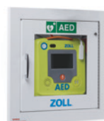
Fully Recessed Wall Cabinet Part# 8000-001258

Meets ADA (Americans with Disabilities Act) requirements 14 inches x 14 inches x 3.5 inches (35.5 cm x 35.5 cm x 8.9 cm)