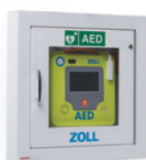
Semirecessed Wall Cabinet Part# 8000-001257

the surface-mounted model for easy installation or the semirecessed or fully recessed models for less intrusive storage. All three models include an ILCOR (International Liaison Committee on Resuscitation) AED label set and installation instructions.