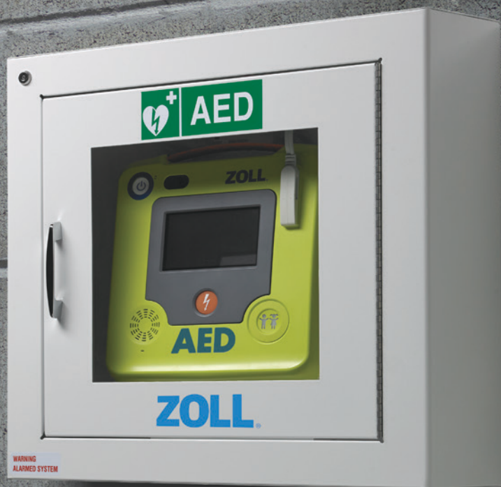
Standard Surface-mounted Wall Cabinet Part# 8000-001256 17.5 inches x 17.5 inches x 7 inches (45.5 cm x 45.5 cm x 17.8 cm)